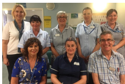
University Hospital of North Durham