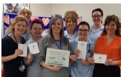
Bishop Auckland Hospital